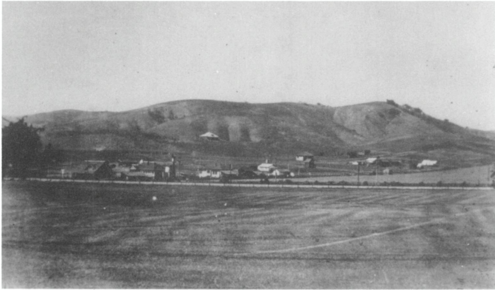
Barren bluff once part of Rancho Rosa de Castilla, now occupied by California State University, Los Angeles.