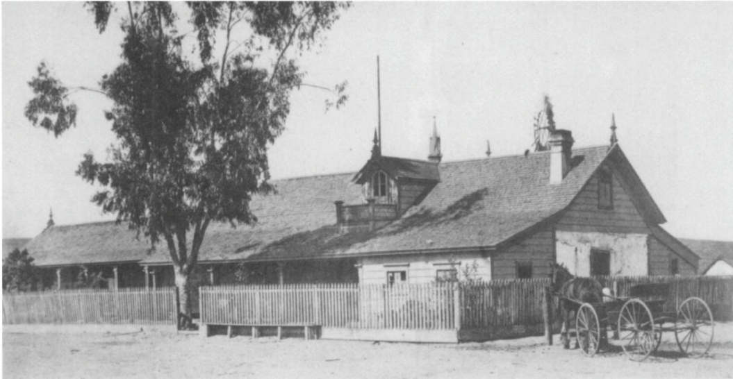
Rosa de Castilla adobe as renovated after 1882.

he hired an Austrian architect to enlarge the home rather dramatically. Photographs of the structure taken at the turn of the century reveal only one rectangular wall and window of the original adobe exposed. Clapboarded wings and a pitched roof with a dormer window have been added. The house has also apparently been lengthened with a veranda and picket fence. The architectural effect is decidedly more French than Mexican, though the adobe wall recalls the Spanish and Indian heritage. A panoramic photograph of the ranch buildings reveals the El Sereno hills to the northwest and the San Gabriel Mountains in the background. This landscape indicates the adobe faced east away from the bluff on which the present structures of Cal State LA rest. A map drawn in 1871 places the ranch house on the west side of Arroyo Rosa de Castilla, now the Long Beach Freeway, probably the parking lot at the base of the bluff. The Batzes would reside in the renovated adobe for over twenty years. 38