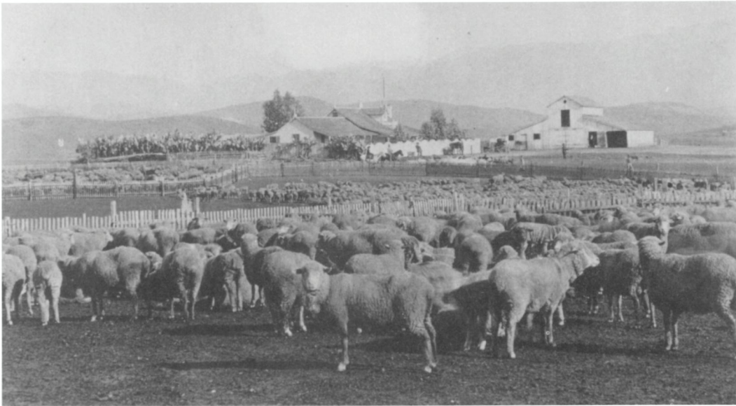
Panoramic view of Rancho Rosa de Castilla, c. 1885.