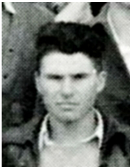
Photograph of Robert John Laxalt at age 18, taken from