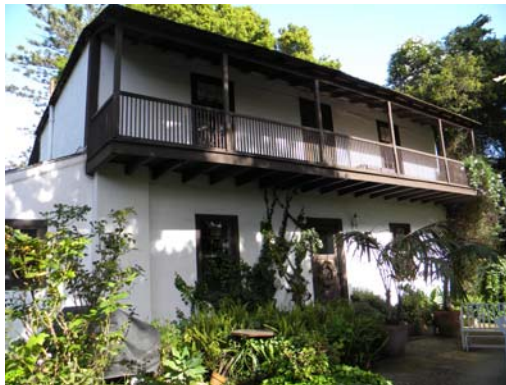
Originally the front; now the back side of the house

Willard Thompson, "Montecito's Nineteenth Century Adobes and the Settlers Who Built Them," Noticias (2009)